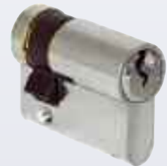
5222 Half Profile Cylinder