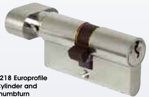
5218 Europrofile Cylinder and Thumbturn