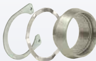
5231 Round Mortice Cylinder Guard