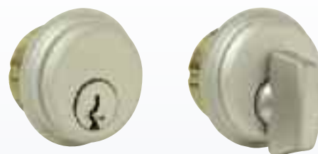
5228 Round Mortice Cylinder