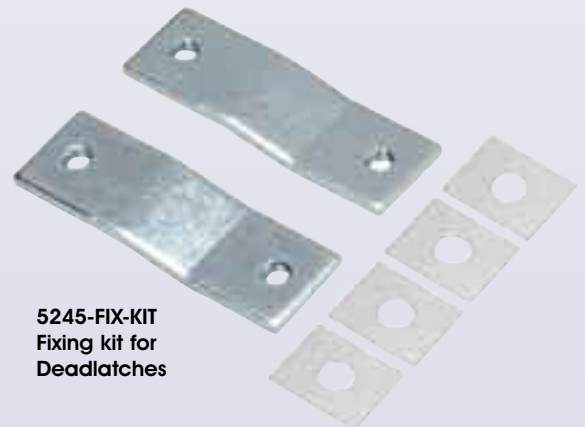
5245-FIX-KIT Fixing kit for Deadlatches