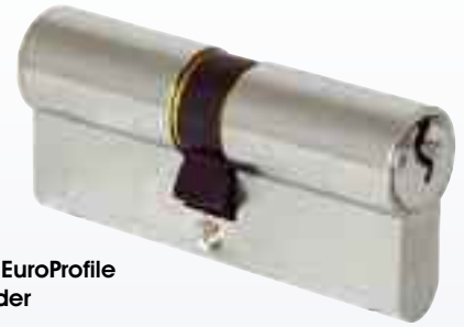
5214 EuroProfile Cylinder