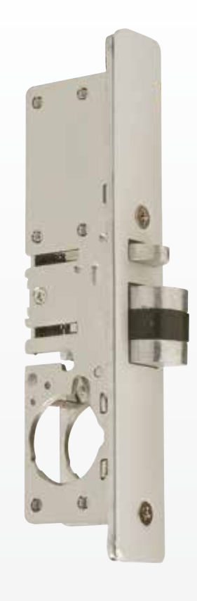
524510 Lock Type